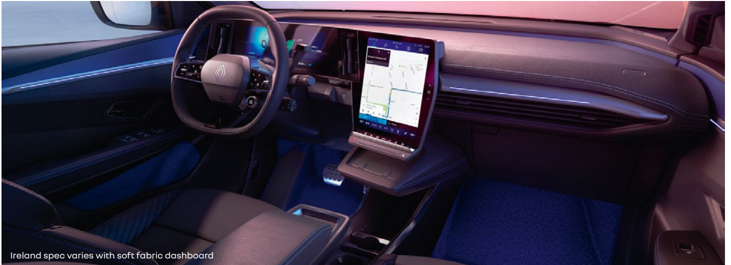
Ireland spec varies with soft fabric dashboard