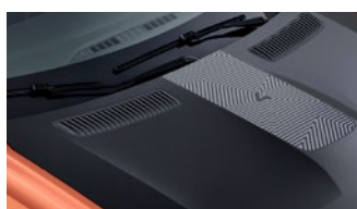
numbeR4 silver bonnet decor