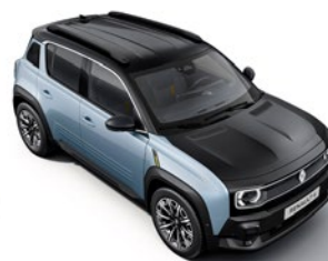
two-tone paint with black roof and extended black bonnet