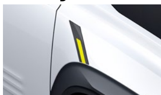
fl4sh yellow front wing decors