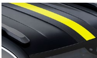
fl4sh yellow roof decor