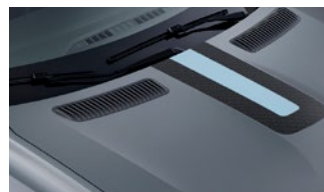
fl4sh blue bonnet decor