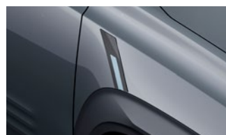
fl4sh blue front wing decors