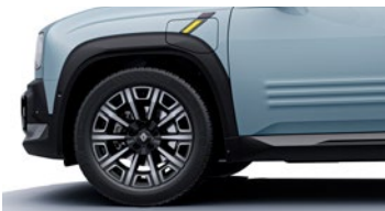
18-inch "Parisienne" black diamond cut alloy wheels and front wing decor