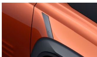
numbeR4 silver front wing decors