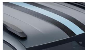
fl4sh blue roof decor