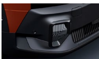
numbeR4 silver bumper decors