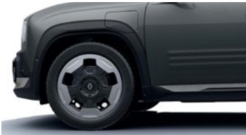
18-inch steel wheel with wheel trim