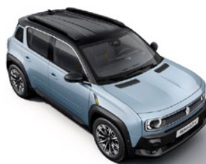
paintwork two-tone black roof