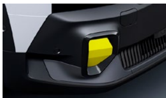
fl4sh yellow bumper decors