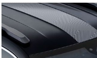
numbeR4 silver roof decor