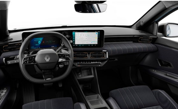
• 10" driver display and openR link 10" : multimedia system with navigation and Google services built-in • reno the official Renault avatar with ChatGPT