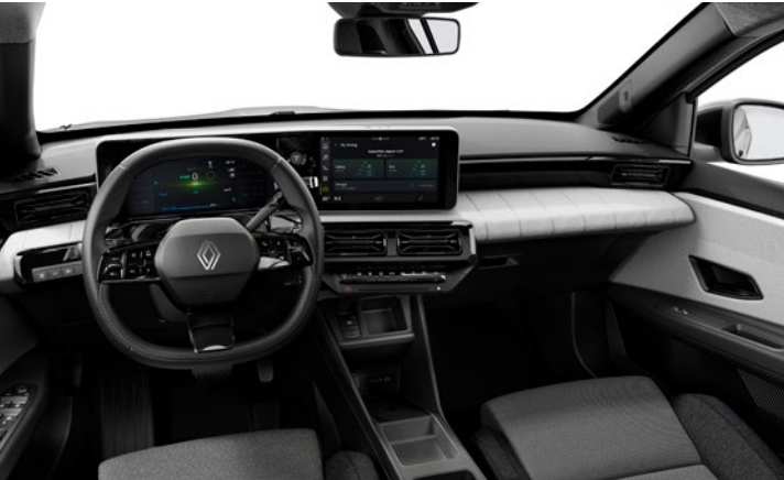
• 7" driver display and openR link 10" : multimedia system with radio • wireless smartphone replication compatible with Apple CarPlay™ and Android Auto™