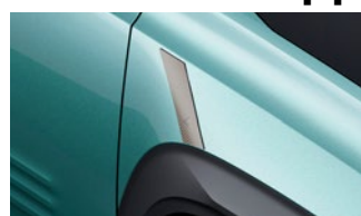
numbeR4 copper front wing decors