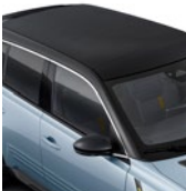
electric canvas sunroof on the plain sud™ version, with glass antenna (1)