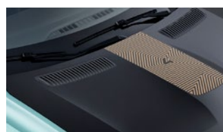
numbeR4 copper bonnet decor