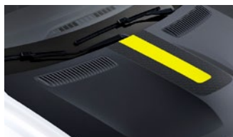
fl4sh yellow bonnet decor