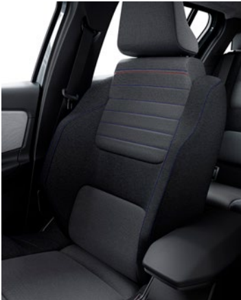
upholstery: grey quilted textile upholstery, with blue, white and red stitching