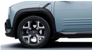
18-inch "sixties" black diamond cut alloy wheels and front wing decors