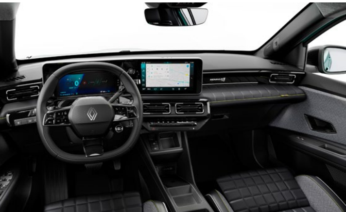
• heated front seats • heated steering wheel • rear occupant safe exit alert • electric handsfree tailgate • two-tone paint