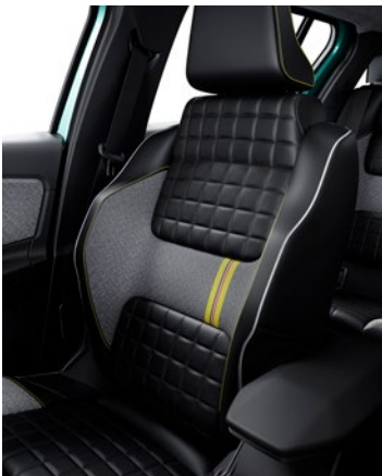
mixed recycled upholstery / black quilted refined textile / grey houndstooth textile with yellow ribbon