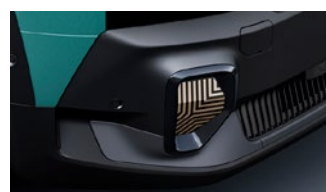
numbeR4 copper bumper decors