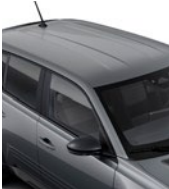
fixed roof with whip antenna