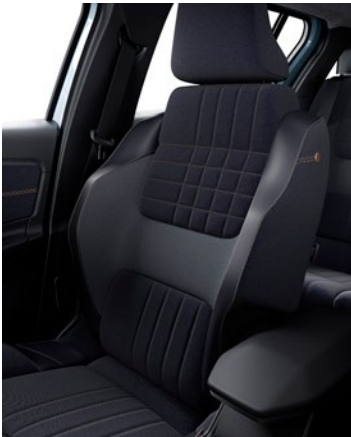
mixed recycled upholstery, quilted "jeans" textile with copper stitching and rivet / dark blue refined textile