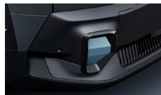
fl4sh blue bumper decors