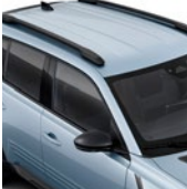
fixed roof, black fixed longitudinal aluminium roof bars & shark fin antenna