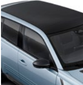
electric canvas sunroof on the plain sud™ version, with glass antenna (1)