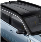
fixed roof, black fixed longitudinal aluminium roof bars & shark fin antenna