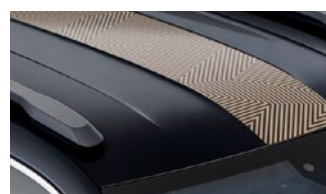
numbeR4 copper roof decor