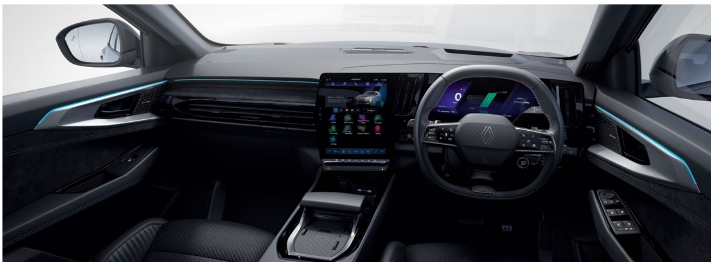
iconic esprit Alpine